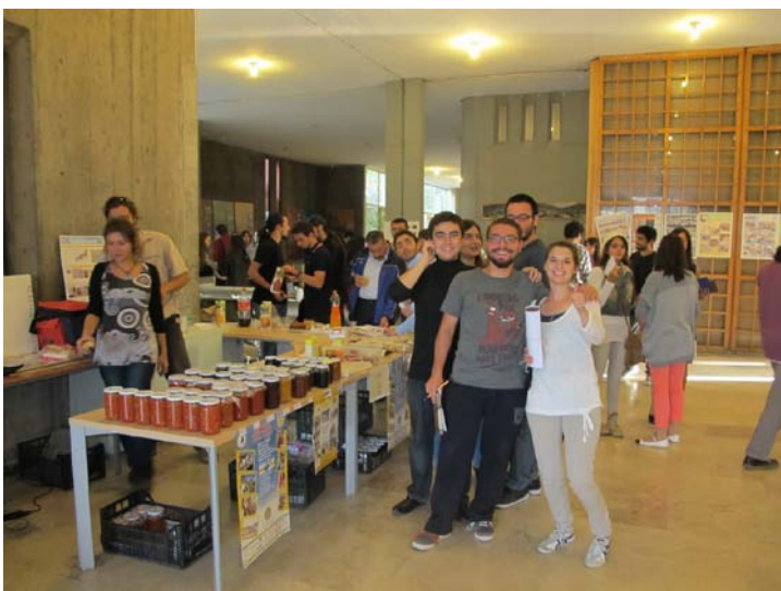
Figure 10. In October 2012 promotional events included an exhibition and mini kermes at METU. Students who took part in the Hands on Building course at the Kerkenes Eco-Center in June and September 2012 exhibited posters and presented their project work to a jury.