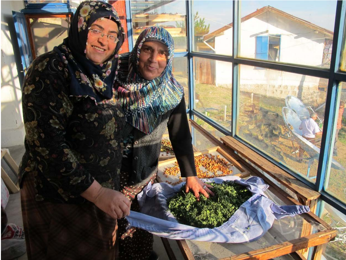
Figure 3. Şahmuratlı village ladies using the drying racks in the solar building for their own garden produce.

When in 1993 the Kerkenes Project was inaugurated to study the Iron Age capital that had once stood on the Kerkenes Mountain, which overshadows the village of Şahmuratlı, Sorgun, Yozgat (Fig. 3), a central concern was, and continues to be, that any impact, social, cultural or economic, should be for the benefit of the village and the region.