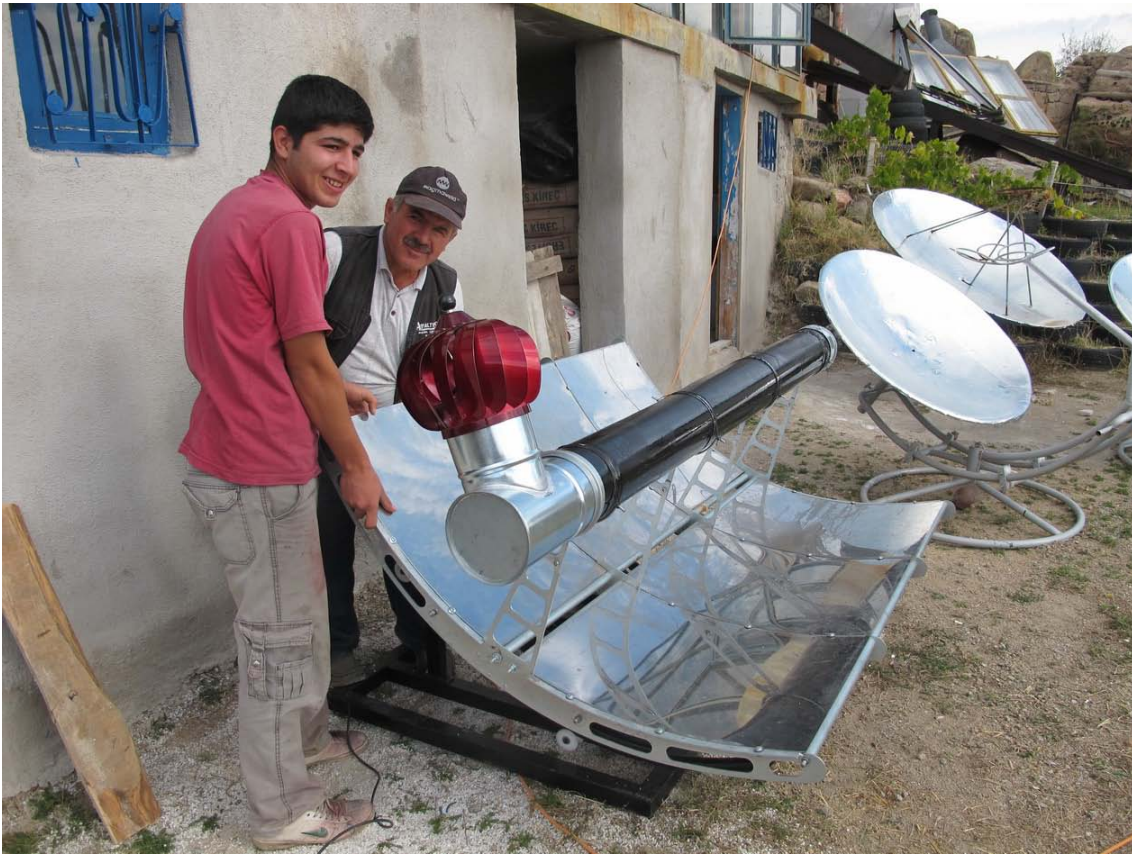
Figure 1. New parabolic solar cooker completed in 2012.

REQUEST FOR A CONTRIBUTION TOWARDS THE 2013 PROGRAM OF ACTIVITIES